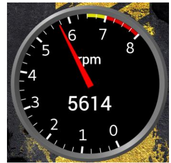
Figure 3 - Silver