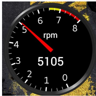
Figure 2 - Black