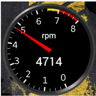
Figure 1 – Grey